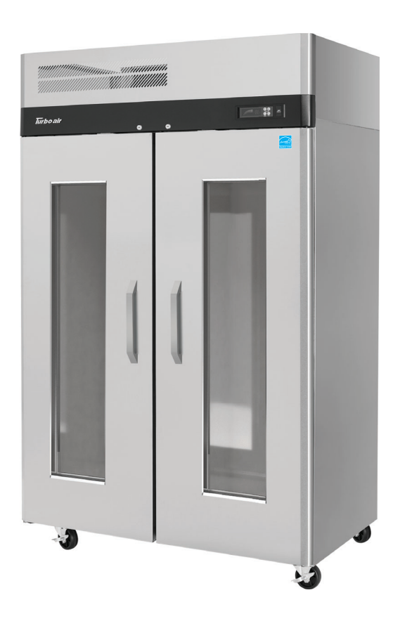
Patented Self-Cleaning Condenser