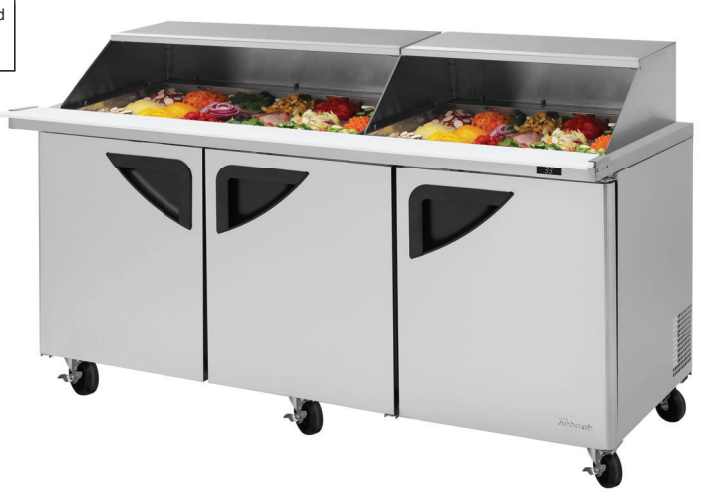
Removable cover with slide back lid

This product is equipped with a fine mesh filter to the front of the condenser to catch dust, and a rotating brush that moves up and down daily to remove excess buildup outward and away.