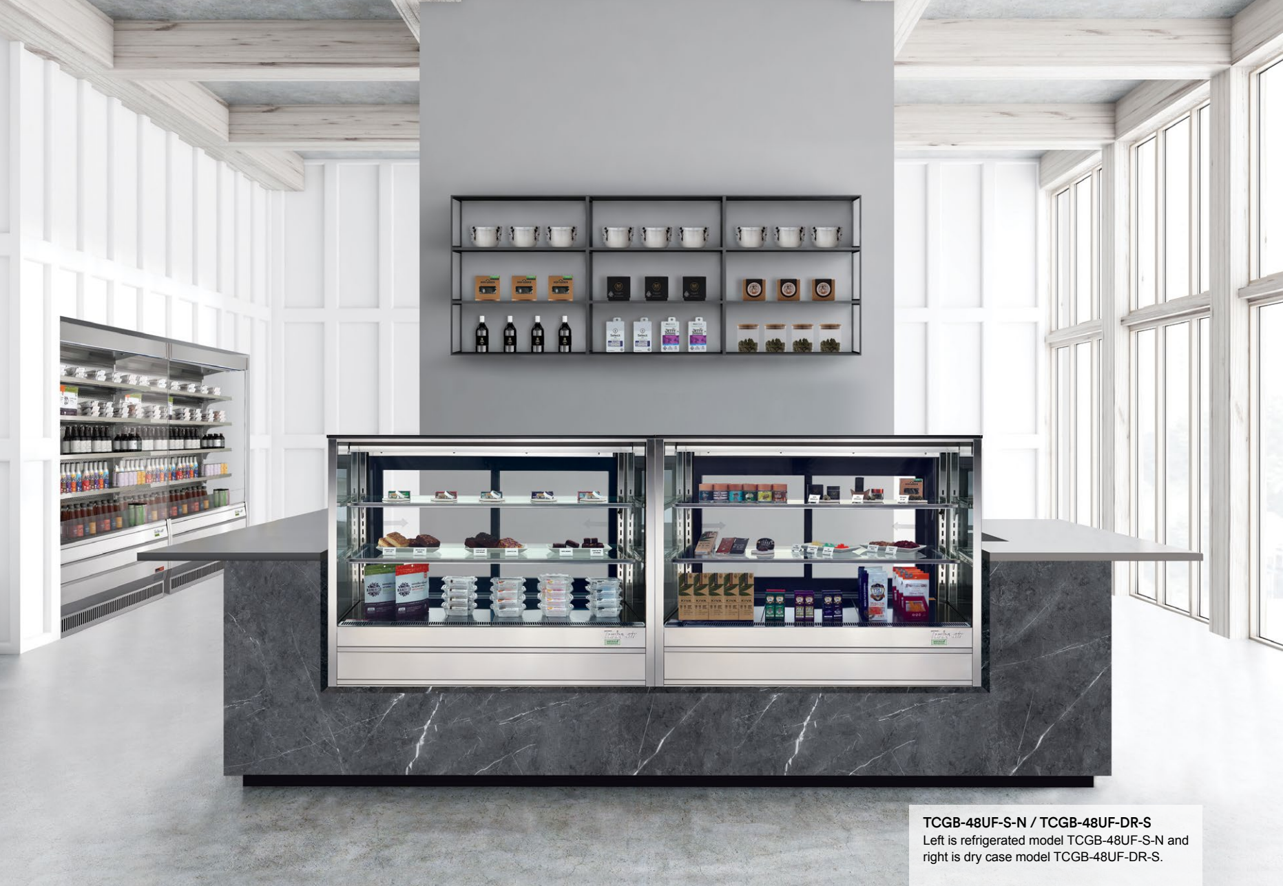
TCGB-48UF-S-N / TCGB-48UF-DR-S Left is refrigerated model TCGB-48UF-S-N and right is dry case model TCGB-48UF-DR-S.